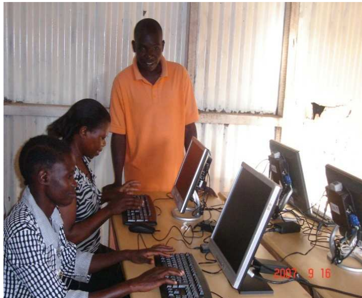
A typical ICT training centre/Internet café in Amuria town, Amuria district

Like all other projects of RCDF, the facilities are established as partnerships between UCC and a private or public partner.