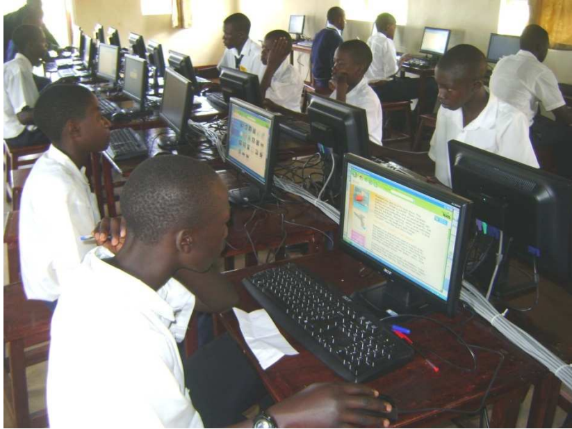
A typical ICT laboratory at Mukono High School, Mukono district

The specific names and locations of schools with RCDF supported ICT laboratories in the district are shown in the Annex