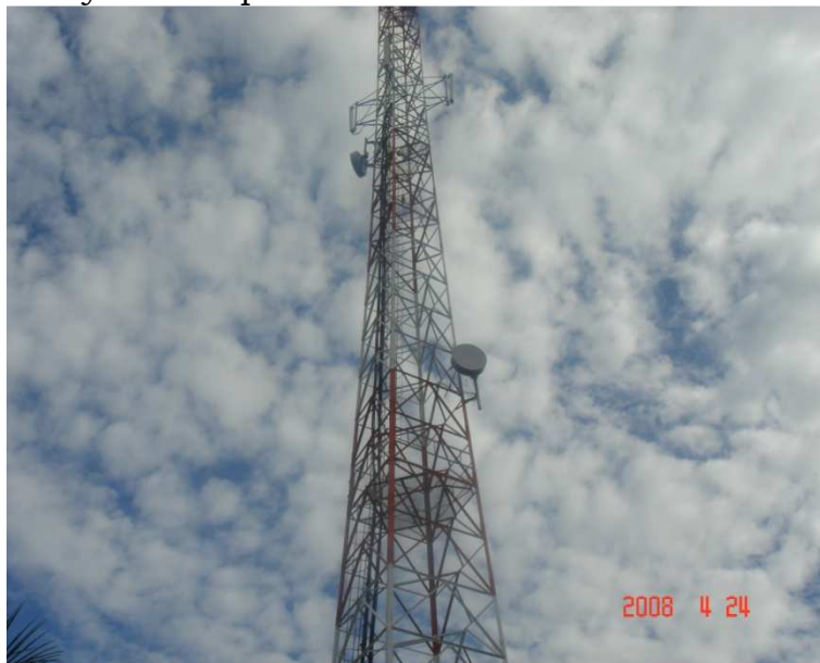
A typical POP in Tororo town

Through a competitive bidding process, the Uganda Telecom Ltd won the tender for subsidy to set up POP in the district.