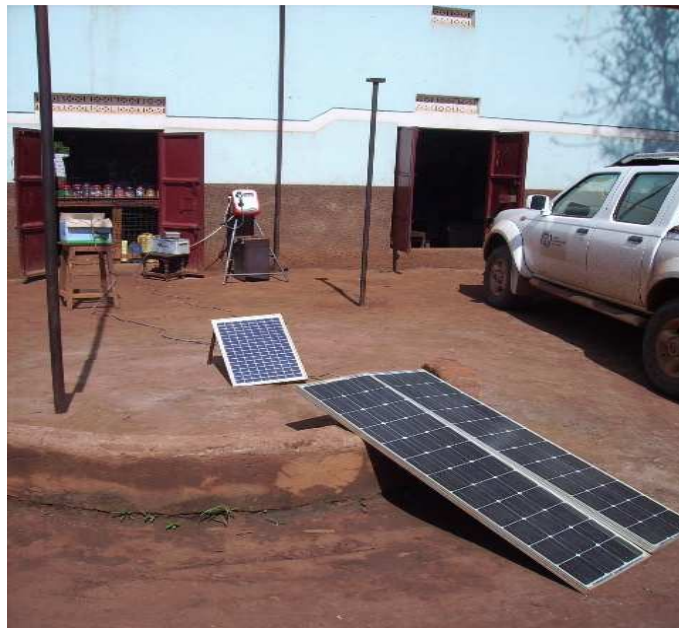
A typical public pay phone in Oyarotonge village, Pader village

The CIC also provides other basic services such as charging phones A detailed list showing locations of public pay phones in the district is shown in the Annex.